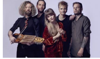
Norway Gåte - Ulveham